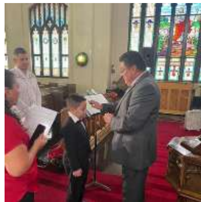
Spanish Language Services