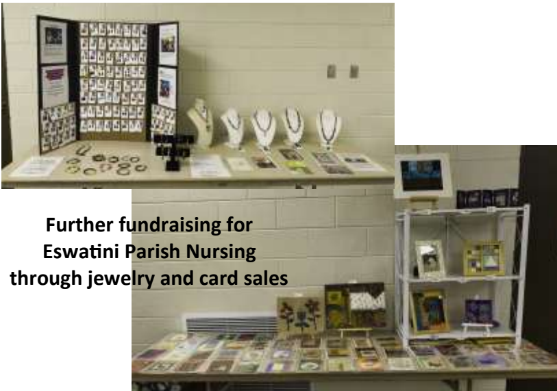
Further fundraising for Eswatini Parish Nursing through jewelry and card sales