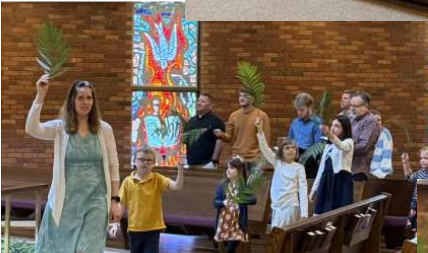
Children waving palms and guitarists lead the procession through the sanctuary to "Hosanna, Loud Hosanna."