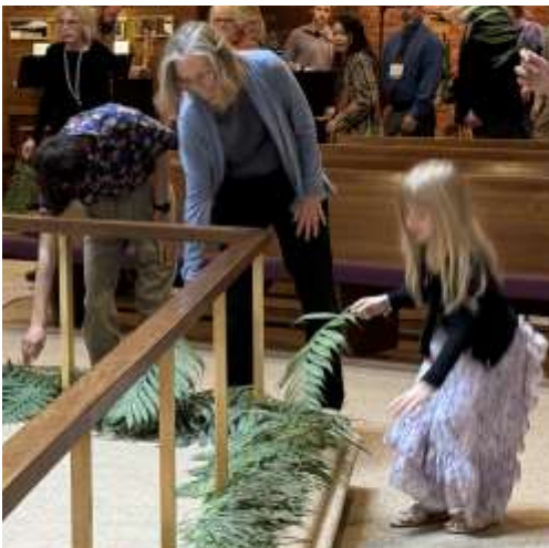
Congregants lay palms at the communion rail