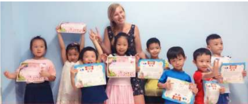
TEACHING ENGLISH AS A SECOND LANGUAGE