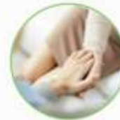
Mental Health Counseling