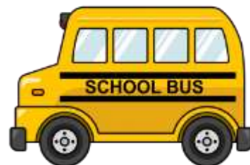
School Starts Iowa City August 23