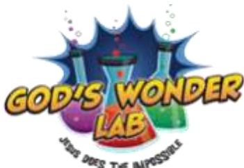
Vacation Bible School August 7-11 5:00pm Fellowship Hall