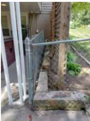
<— The finished product The footing is complete and the upper porch is now made safe again.