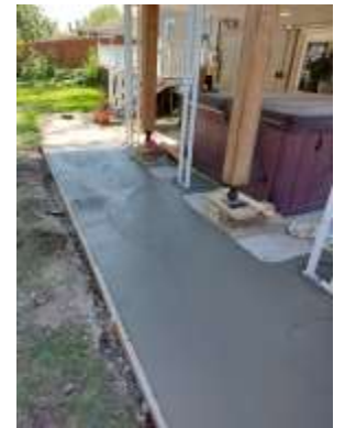
Forms are put in place & new concrete slab is poured.