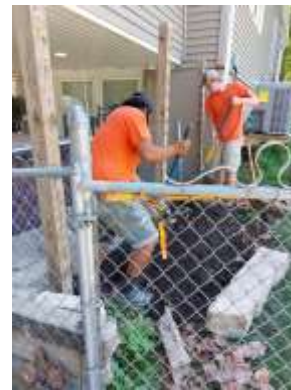
Lets not forget the finishing touches to make this project complete.