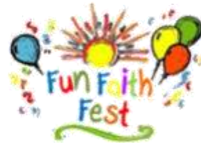
August 14 11:45am Outdoors