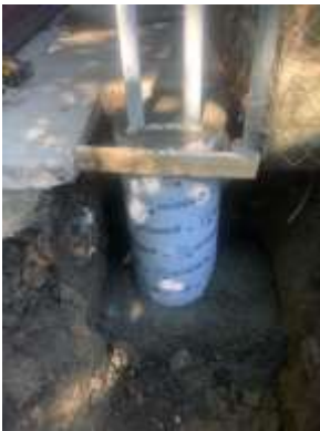
New footing has been poured and now it sets and cures.