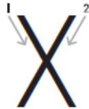
Big Line Big Line