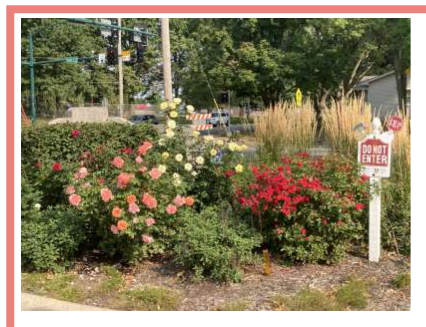
DO YOU SEE IT?