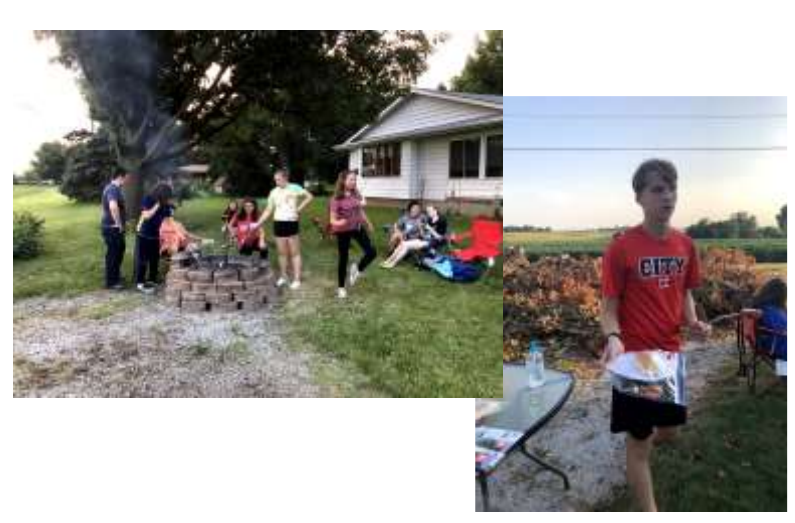
S'mores & More at Bohnsacks