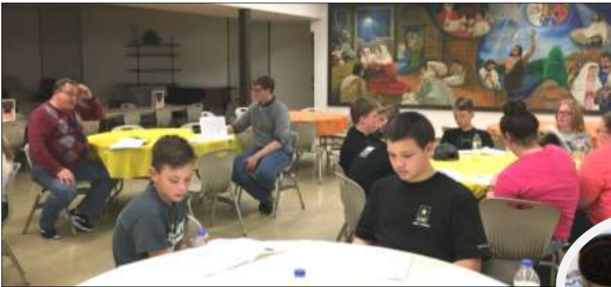
There was Bible Study on Rejoicing