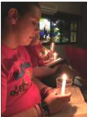
There was Worship in the chapel