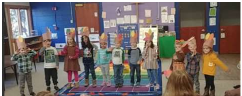
Fall Program—Happy Thanksgiving!

Thanks for ordering books from scholastic. Here are the free books for our classroom. They sent me an assorted pack this time. All who ordered I have your books in a brown bag so no one can see through them.