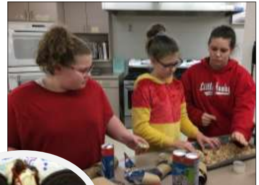
There were snacks