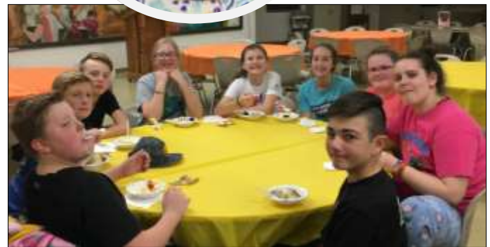
There was socializing among the confirmands