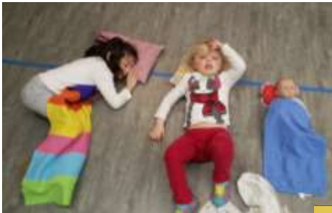
Playing with the baby dolls. They are taking naps