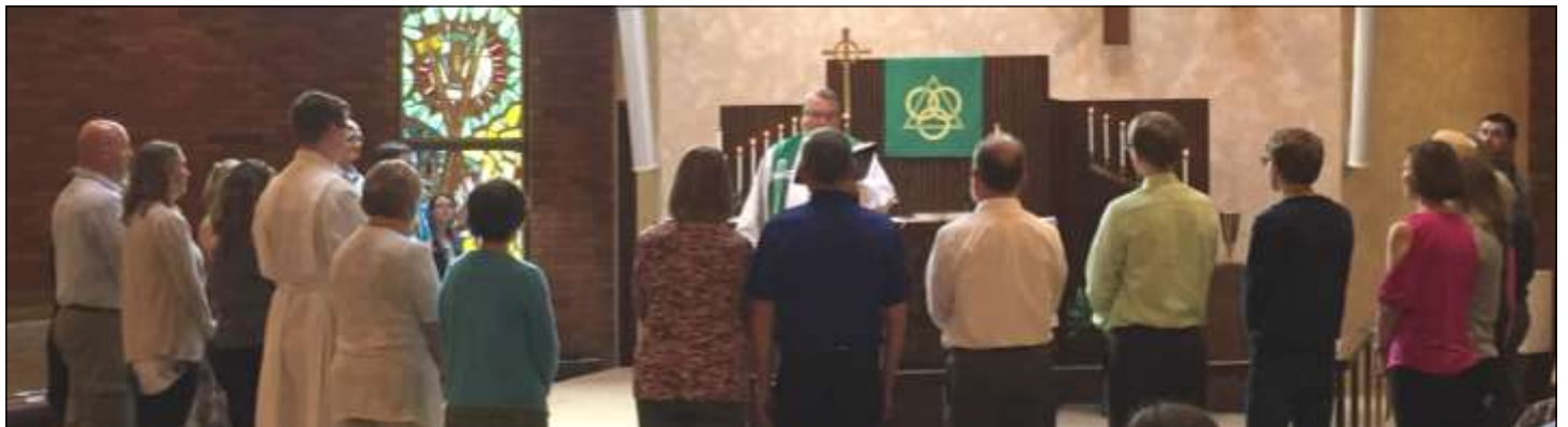
Blessing of teachers — Sunday School, Midweek, Small Group

Presentations to 3 year olds, 1 st , 3 rd , and 11 th graders