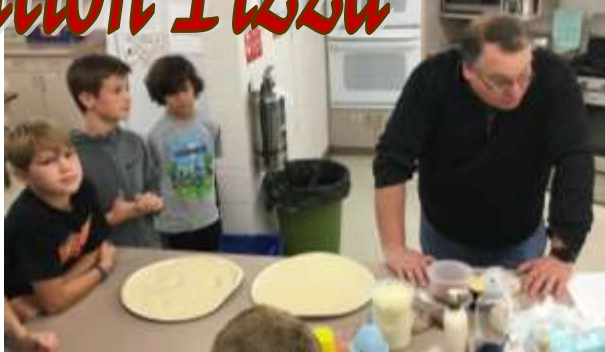
Day 2—Sky (crust)