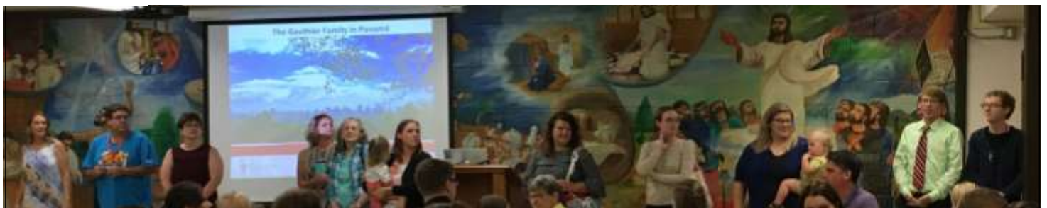
Sunday School teachers were introduced to their classes and left together for their classrooms

11 th Graders — Concordia's Complete Bible Handbook