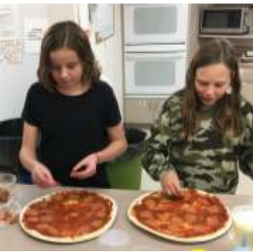
Day 3—Land, Sea, Plants (pepperoni)