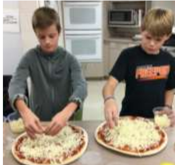
Day 4—Sun, Moon, Stars (cheese)