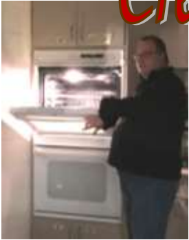
Day 1—Light (oven)