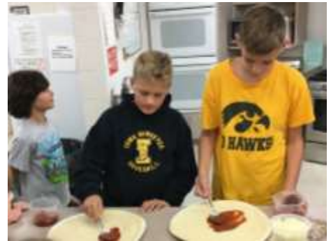
Day 3—Land, Sea, Plants (sauce)