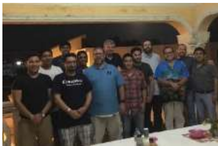
Students & faculty of seminary in the Dominican Republic

Additionally, join me in giving thanks that the deaconess program is set to begin this fall, offering courses in Panamá to women interested in serving as deaconesses. To God be the glory!