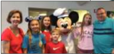
24 Members of Our Redeemer join in a visit to Disney World