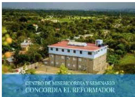
Seminary & Mercy Center in Palmar Arriba, Dominican Republic

Greetings in Jesus! The first academic year for Concordia El Reformador, the Lutheran seminary in the Dominican Republic, has come to a close. In its first year, the seminary had 10 residential students from seven countries (Dominican Republic, Mexico, Guatemala, Peru, Venezuela, Bolivia, and Chile) and 40 students in its online program. This is truly