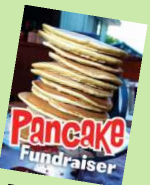
For Crisis Center Saturday, March 3 7:00am-1:00pm