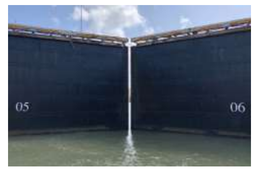
"The way between the seas"