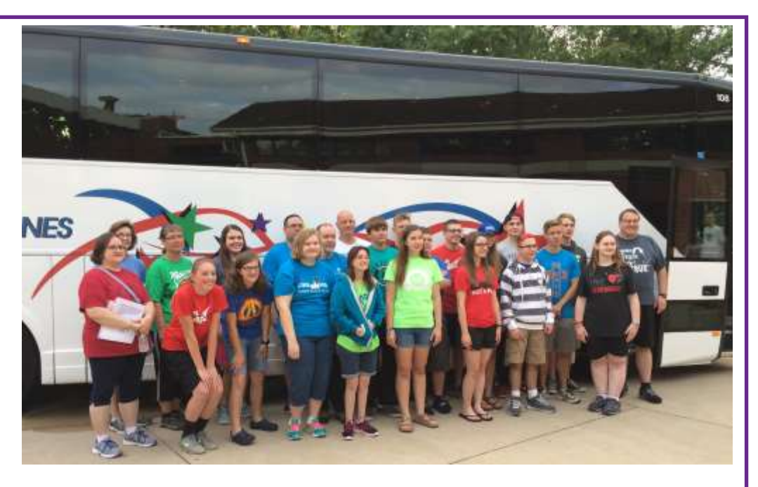
And they are off to New Orleans!

Thrivent is providing Action Team funds to help pay for food during this trip.