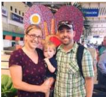
Our first day in Santiago, DR

When I am bruised with humiliation, I hear the words spoken at my baptism, "In the name of the Father..." As I stumble daily, I am met with the words, "...I forgive you in the name of the Father..." In the times I fall flat and feel completely alone in this foreign place these words hit my ears, "Take, eat, this is the body of Christ..." The psalmist writes "Your word is a lamp to my feet and a light to my path" [Ps 119:105]. Thanks be to God that we are not out here alone. The Word of God is a light for our path and our precious Lord Jesus is with us each step we take, even as we stumble and fall learning to walk again. To God be the glory.