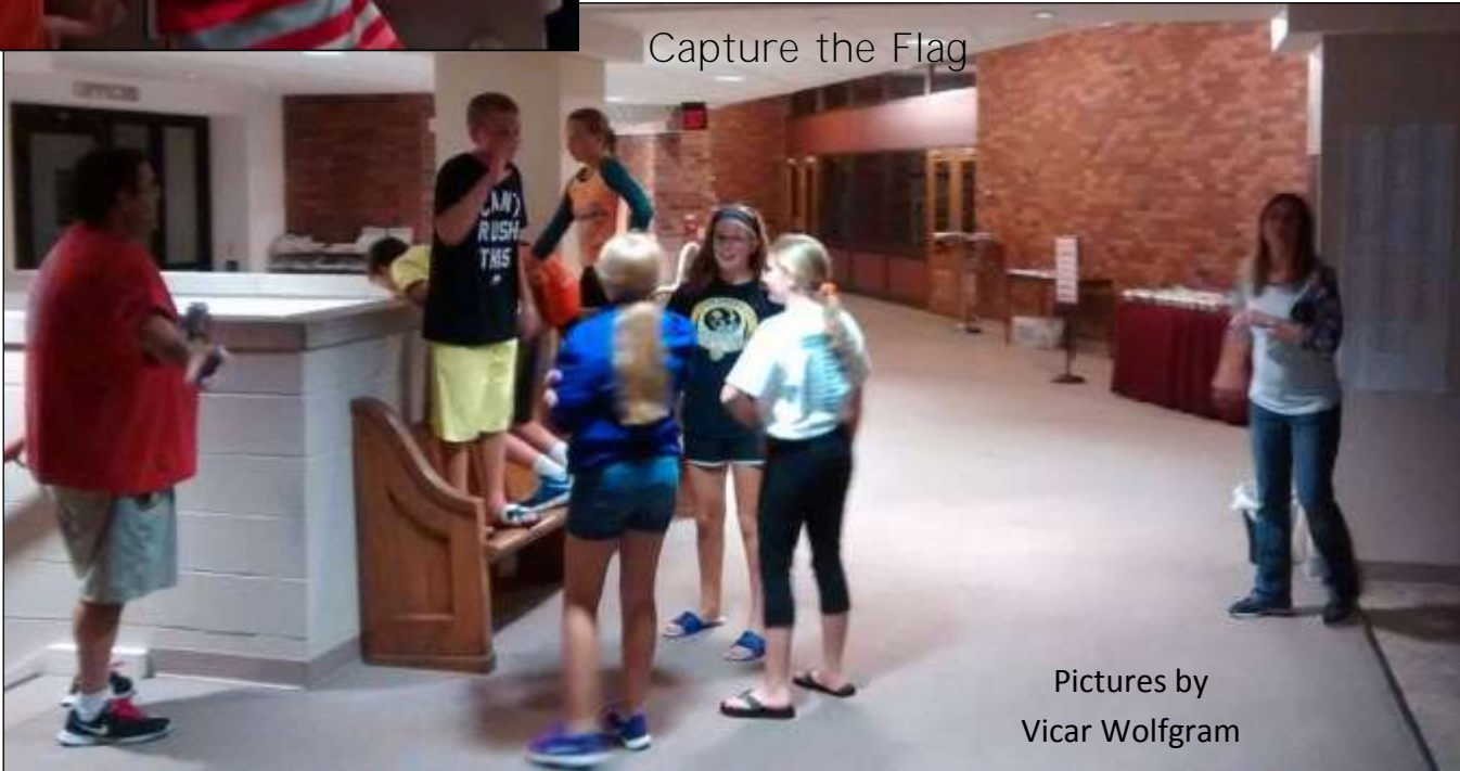
Capture the Flag