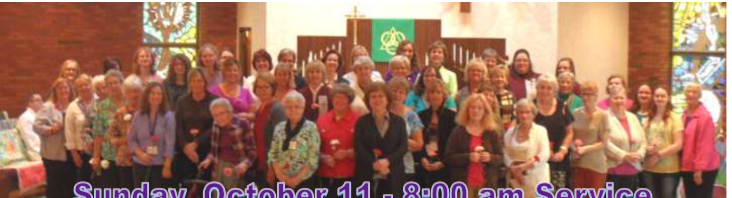
Sunday, October 11 - 8:00 am Service