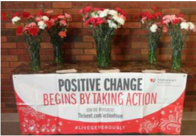
Thrivent and the LWML Mission Guild recognize the women of the congregation