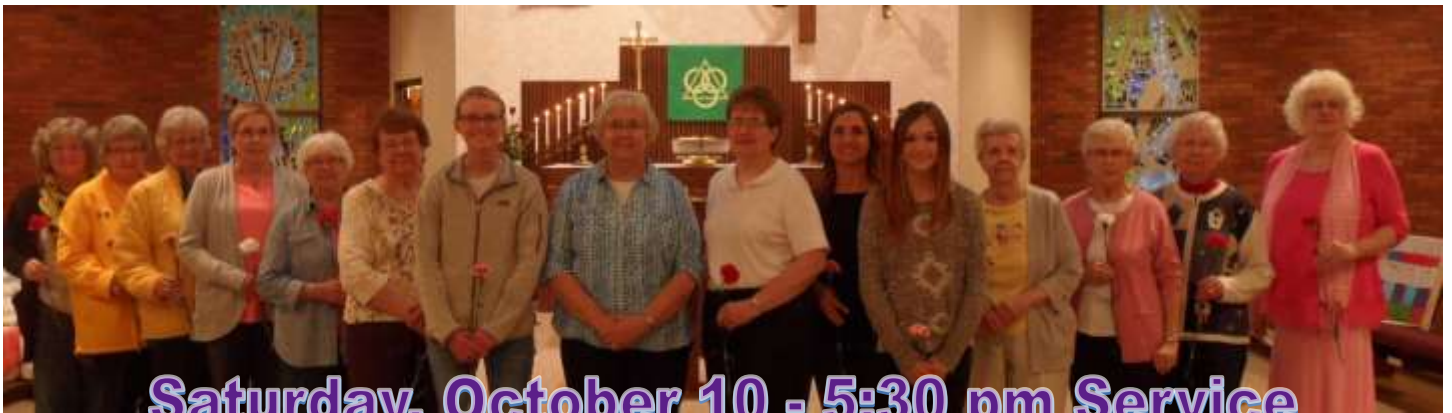
Saturday, October 10 - 5:30 pm Service