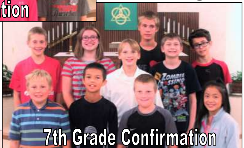
7th Grade Confirmation