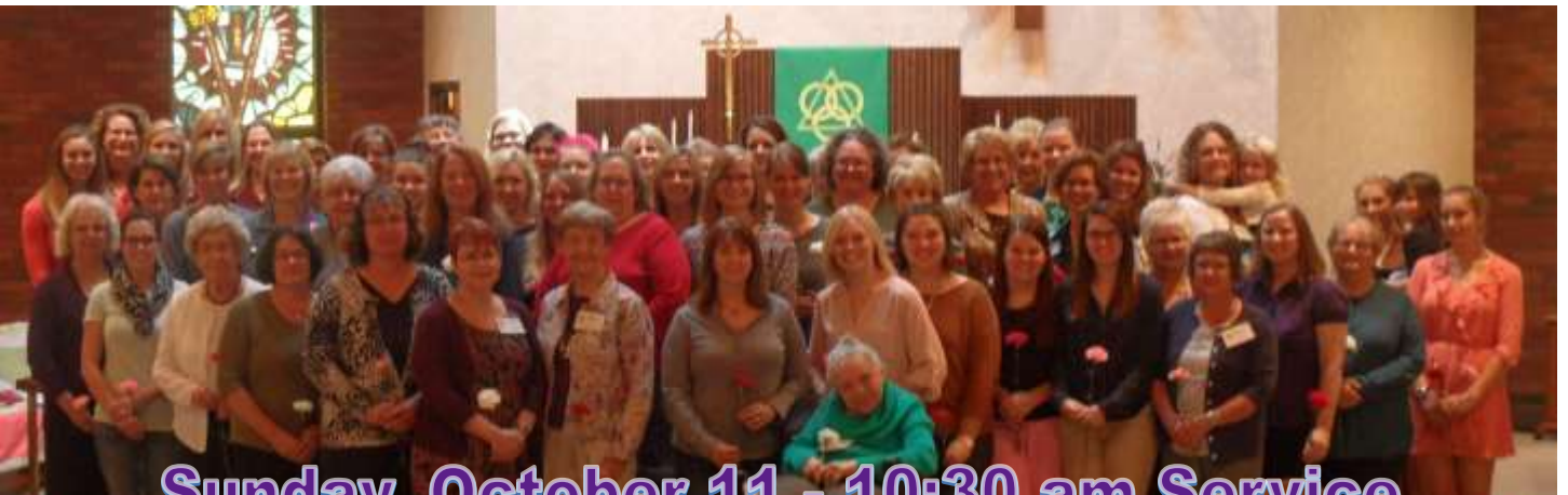
Sunday, October 11 - 10:30 am Service