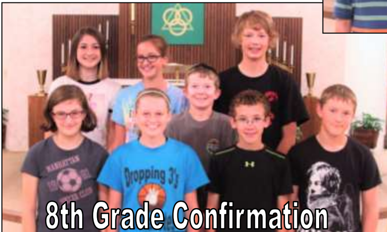
8th Grade Confirmation