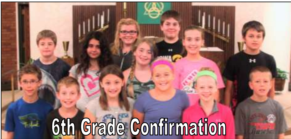
6th Grade Confirmation