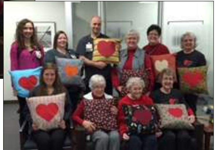
UIHC Cardiac Pillow