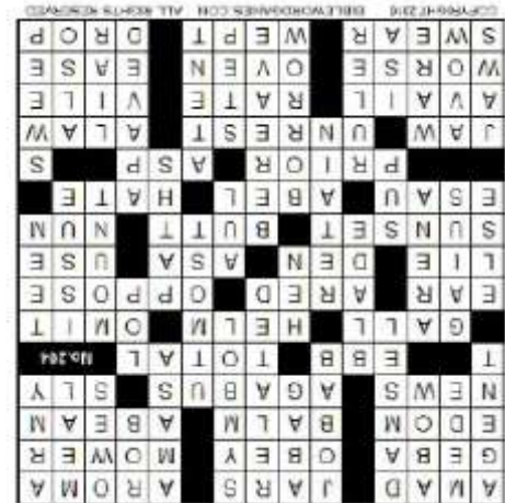
Used with permission biblewordgames.com Family Christian Bible Crossword puzzle No. 204