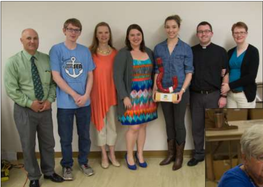
Trivia has a winning team!