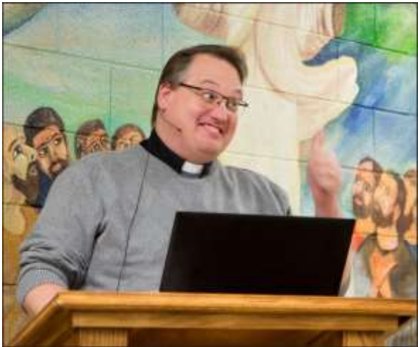
Trivia has a great emcee!