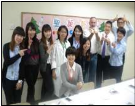
Sign language class at the Macau Concordia Special School.