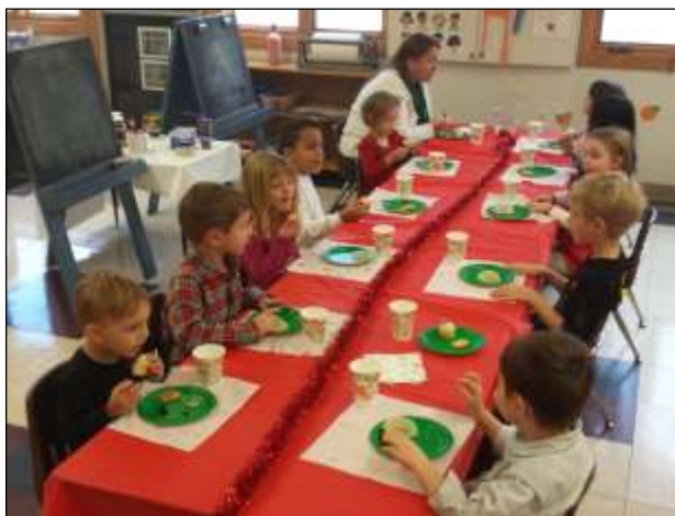
Searching for the Wise Men with Pastor