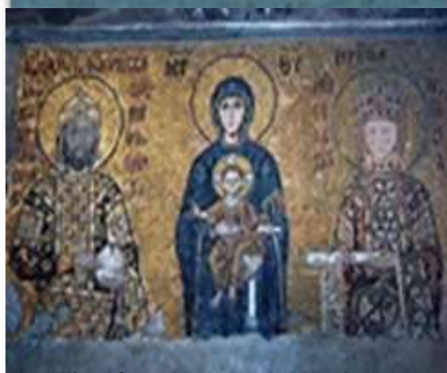
The Comnenos Mosaic