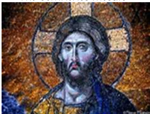
The Deesis Mosaic

Built in the 5 th Century, the Church of Divine Wisdom-Hagia Sophia has had a turbulent history. It has suffered two fires, (one in the year 404 AD and the other in 532 AD), at least four earthquakes between the years 533 and 889, and a Latin invasion in the year 1204 when it was stripped of its ornaments and greatly damaged. Again in 1346, the church suffered another earthquake and was restored in 1354. Mehmet the Conqueror had the church converted to a mosque during the conquest of Istanbul in approximately 1453, when he brought an end to the Byzantine Empire. More recently, during the period of the early Turkish Republic, Mustafa Kemal Ataturk had the church converted into a museum. Despite its tumultuous history, exquisite Christian mosaics created in the 12 th century, still adorn the walls of the Hagia Sophia. The Comnenos (top left) shows the Virgin Mary and baby Jesus and the Deesis Mosaic is the image of Christ created in gold, silver, stone, marble, granite, limestone and terra cotta tiles. As recently as 2007, there was an international push to turn the St. Sophia back into a church and more recently there has been discussion of returning it to a mosque but to date neither has happened. It continues as a museum visited by over a million people each year.